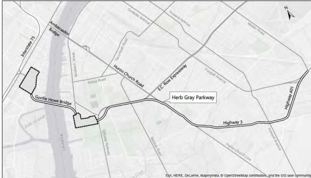
Figure 1: Herb Gray Parkway and Gordie Howe International Bridge with inspection plazas

These three key characteristics of the Bridge will make crossing times both shorter and more reliable, saving about 850,000 hours per year for trucks, which translates into billions of dollars in economic savings over its service lifetime. Since the Ambassador Bridge (or its eventual replacement) will remain in place, the two bridges will provide needed redundancy. The presence of two bridges at the crossing essentially rules out the possibility of a complete shutdown of the Detroit River crossing, a scenario whereby traffic is diverted to the Blue Water Bridge costing over one half billion dollars' worth of excess time every year.